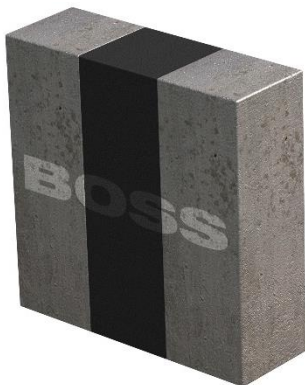
Figure 6 Normal State