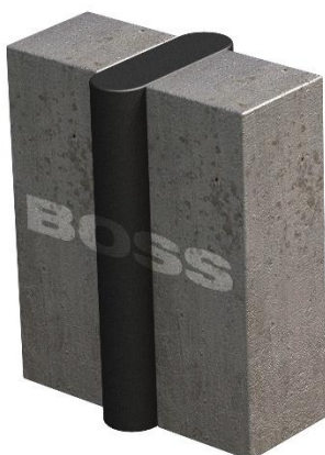
Figure 7 Compressed State: Maximum Strain