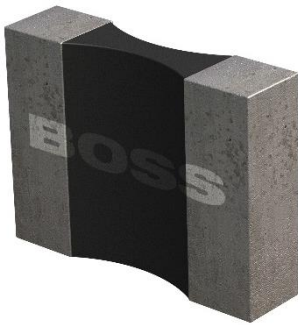
Figure 5 Expanded State: Maximum Strain

In structural sealing situations, the joint dimensions are critical. In Figure 5 one can see the stresses encountered due to structural movement. The sealants cross sectional shape changes but the volume remains constant. Therefore when joints are designed, it is essential to provide a suitable width-to-depth ratio which will enable the sealant to withstand the maximum strain anticipated due to the structural movement of the joint.