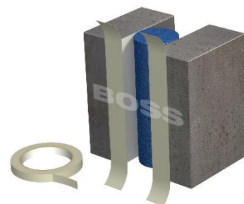
Figure 8. Apply Masking Tape