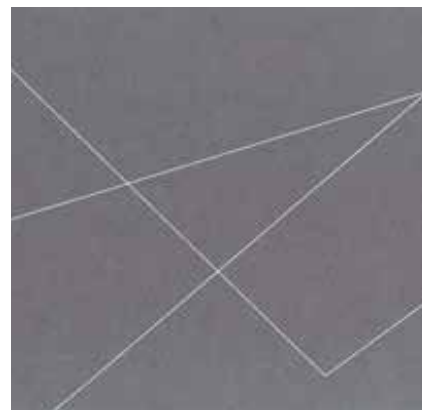
AXIS White on Pewter