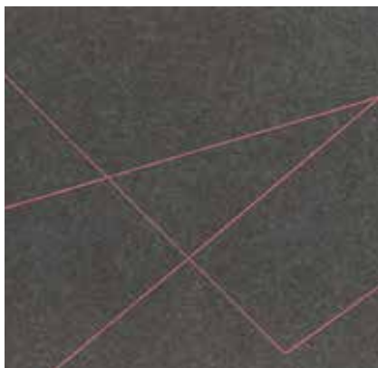
AXIS Neon on Taupe