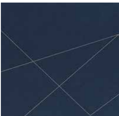
AXIS Blush on Indigo