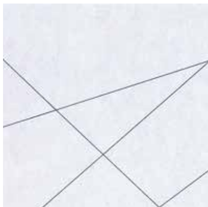
AXIS Flint on Opal