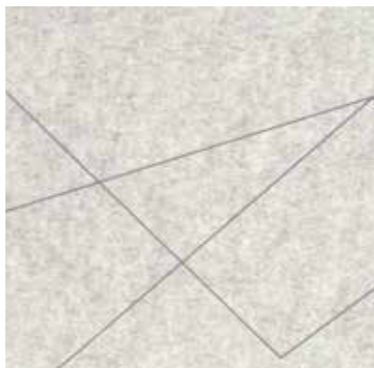
AXIS Putty on Natural