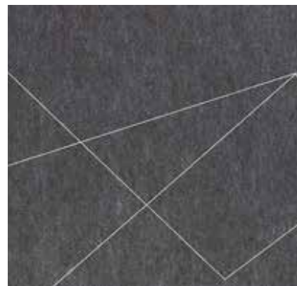
AXIS Ghost on Charcoal