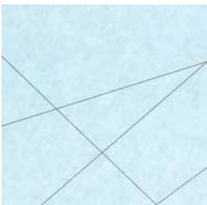
AXIS Putty on Spray